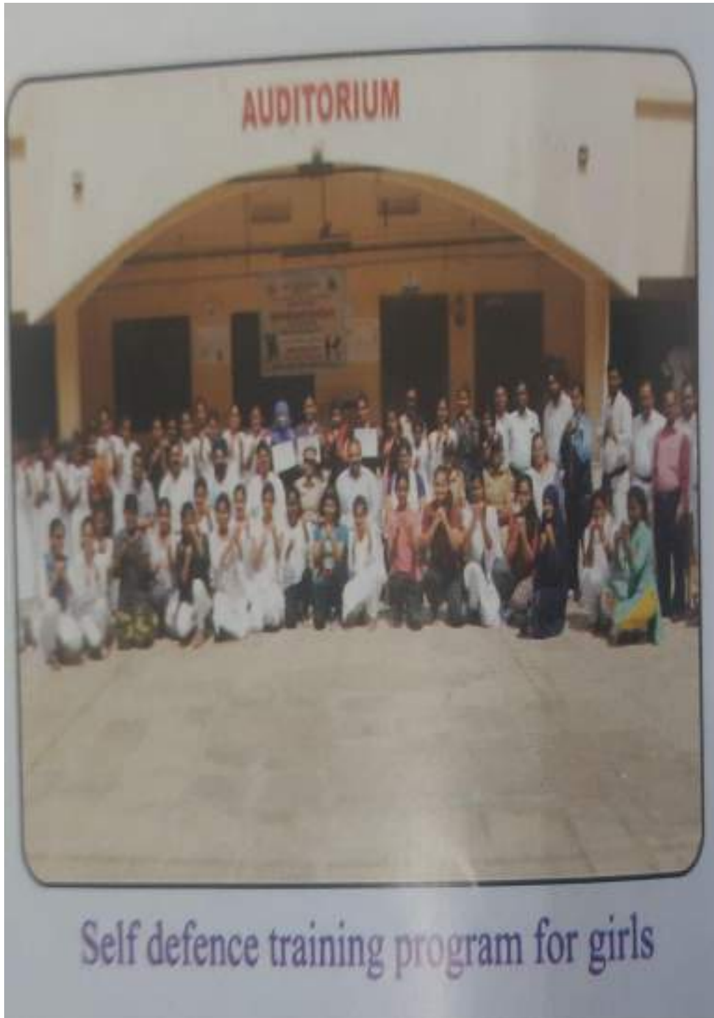
Self defence training program for girls