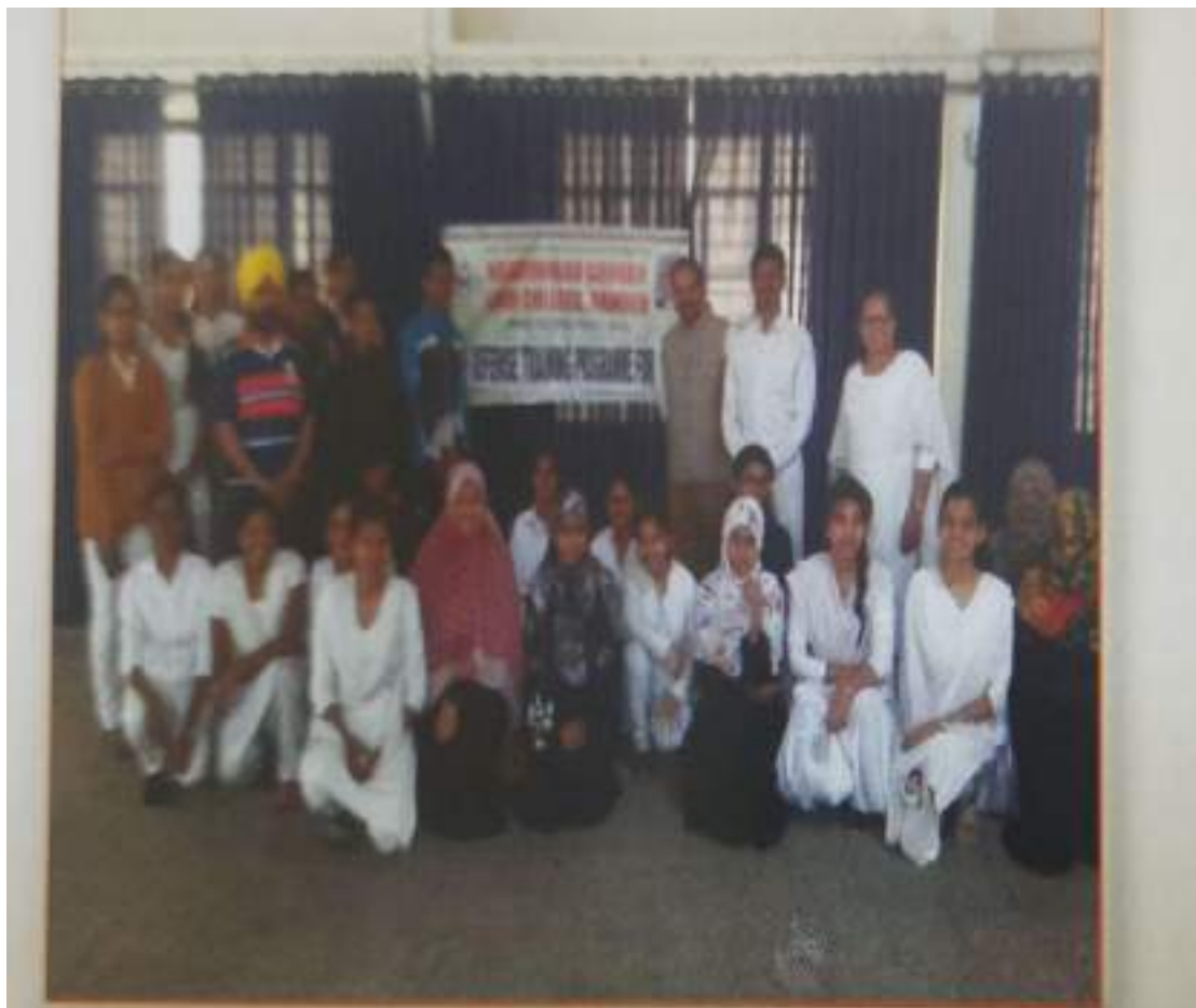
Self Defense training programme conducted for girl students

Photos of Self Defence Technique Training programm (2018-19)